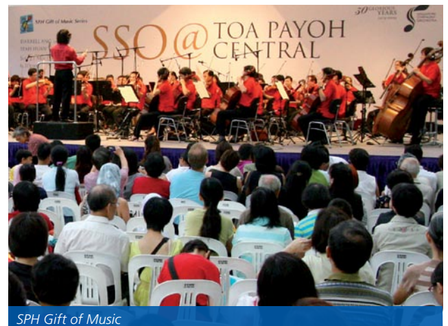
SPH Gift of Music