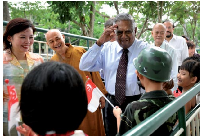
The New Paper's "Be Yourself Day"