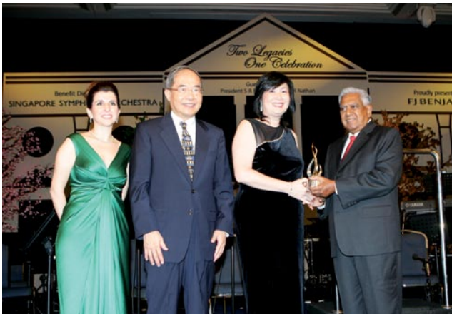
SPH received SSO Benefactor Award

SPH Magazines Pte Ltd was acknowledged as a top corporate donor to the Children's Cancer Foundation.