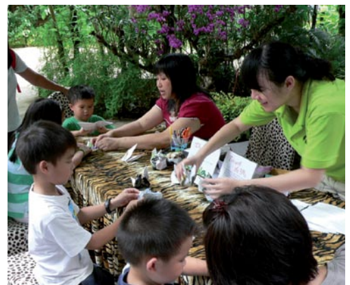
The SPH Foundation Conservation Ambassadors and Wildlife Buddies Programme