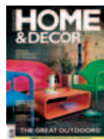
Home & Decor