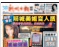
Shin Min Daily News